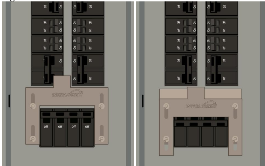
Main Breaker ON