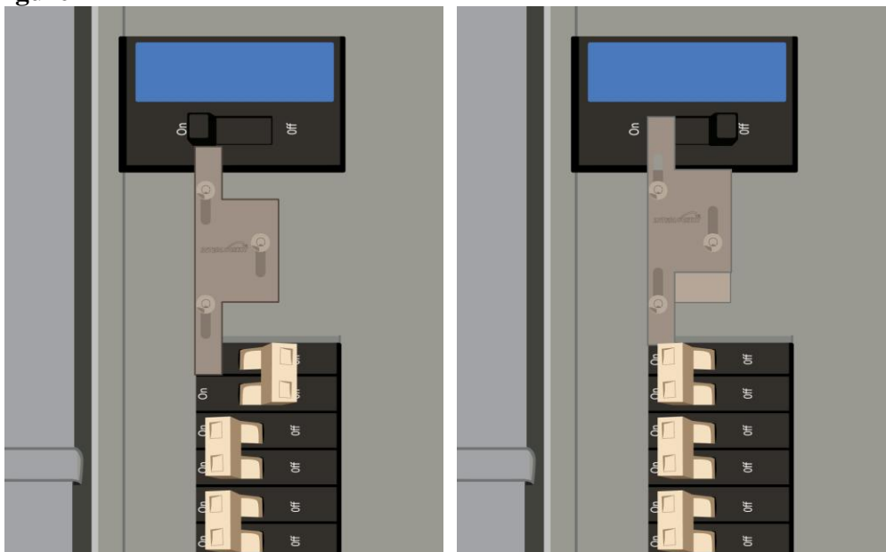
Main Breaker ON