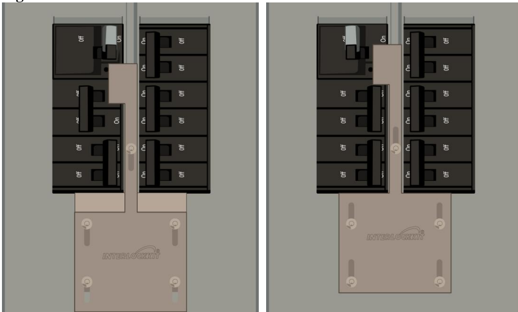
Main Breaker ON